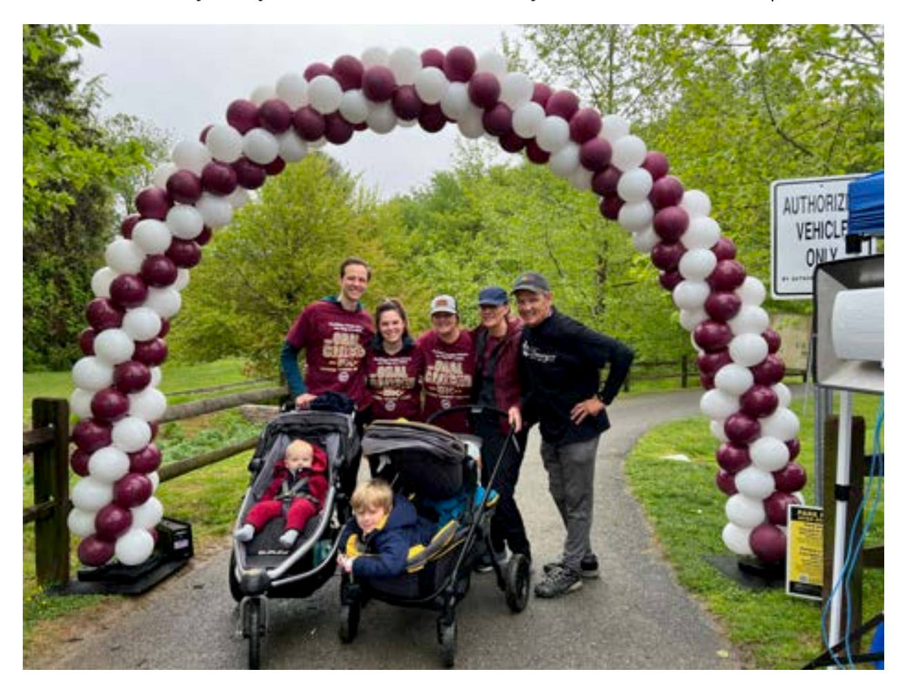
Boost or Burden

One smile for the lessons of yesterday, One smile for the gift that is today, One smile for the wishes and promise of tomorrow